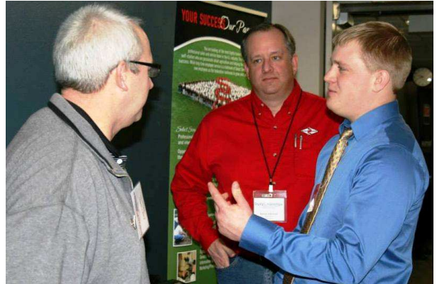
A student visits with representatives from Select Sires, a sponsor of Dairy Challenge since its start in 2002.

Throughout the event, students networked with industry professionals and volunteers. Representatives from many Platinum sponsors, including several searching for both interns and full-time employees, were also available for a career fair held on Friday.