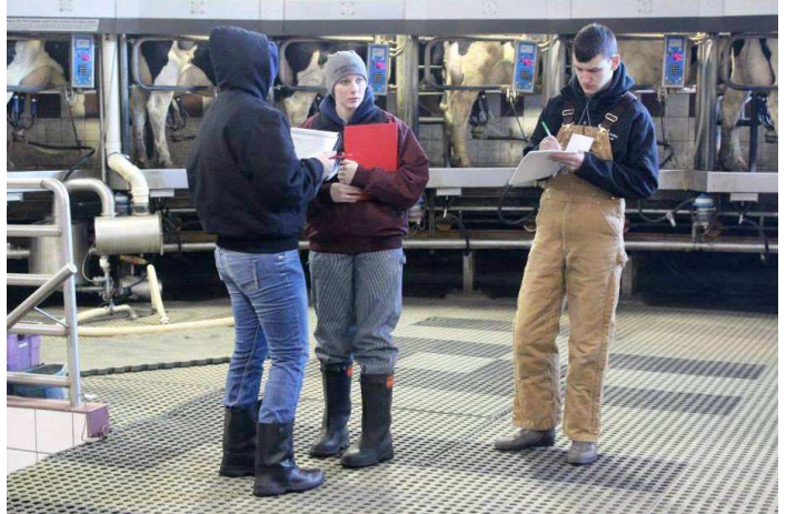
During the Midwest Dairy Challenge, teams took an in-depth view of procedures in the milking parlor.

Host farms were Sugar Creek Farms, New London, Wis., and Country Aire Dairy of Greenleaf, Wis.